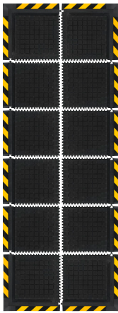
3' x 9' Run